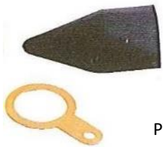
PVC Shroud and Brass Earth Tag