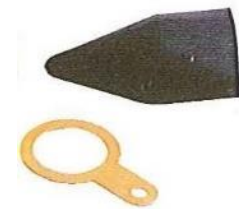
PVC Shroud and Brass Earth Tag