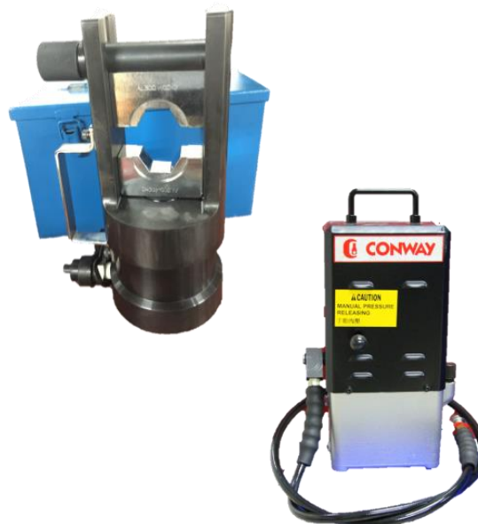
TCCP-1000 Electric Pump